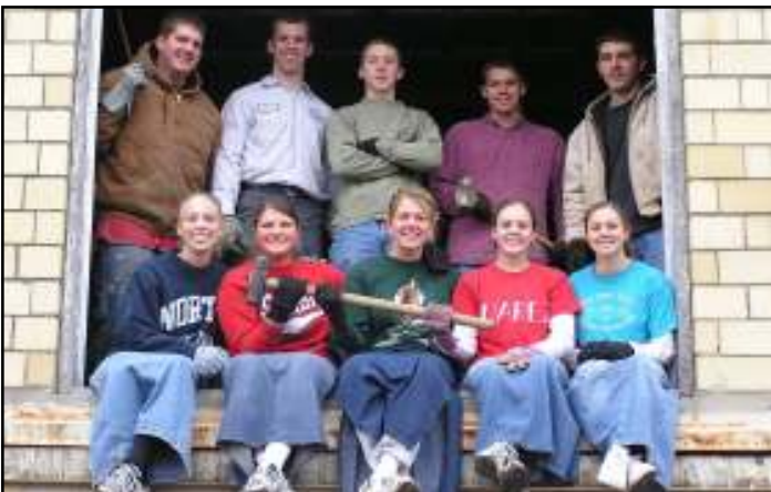
Dozens of workers, including those pictured here, spent many days remodeling the new office. Many businesses also donated materials for free or at cost.

Loving Shepherd International wants to thank the dozens of volunteers who helped transform the former Precision Print building into LSI's new office. We also want to thank the person who sold us the building at a greatly reduced price. The building stands as a monument to the power of Christian charity.